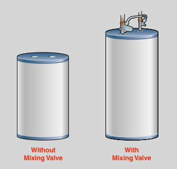
The mixing action of a Honeywell mixing valve can give you up to 60-gallon performance from a 40-gallon tank — it's like adding a larger water heater without taking up the space.

The demands of today's busy families can often be a strain on the hot water supply. But not with a Honeywell mixing valve. By raising the stored water temperature to 140° F or higher, less hot water is required to mix with the cold water to reach a comfortable temperature. The mixing action gives you up to 60-gallon performance from a 40-gallon tank. So the last person in the shower is less likely to come out shivering.