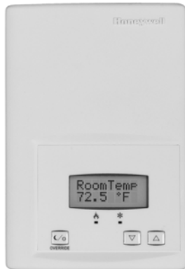
TB7200 Series Thermostat