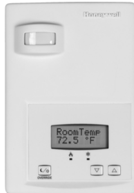
TB7200 Series Thermostat with Occupancy Sensor