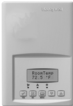
TB7600 Series Thermostat