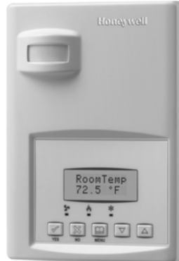
TB7600 Series Thermostat with Occupancy Sensor