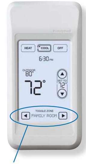
Toggle between zones to set the temperature in any zone from anywhere in the home

With zoning, the Portable Comfort Control can be used to change the set temperature in any zone in the house from anywhere in the house. For example, watch TV downstairs at night, but warm the upstairs bedroom before going to bed. Or, make sure that all zones are turned down for energy savings before you turn the lights out each night. You can even name each of your zones on the Portable Comfort Control by having your contractor customize it with more than 50 different naming options – upstairs, master bedroom, office – even wine cellar and home theater!