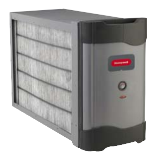
Honeywell TrueCLEAN™ Whole-House Electronic Air Cleaner

If you have pets, smokers, allergy or asthma sufferers in your home, you may want to think about a Honeywell Whole-House Electronic Air Cleaner.