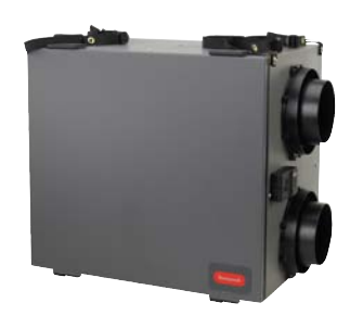
Honeywell Whole-House Energy Recovery Ventilation System

If odors linger in your home, or the air in your home feels stale, it may be a sign that your home isn't getting as much fresh air as it needs. A Honeywell Whole-House Ventilation System can help.