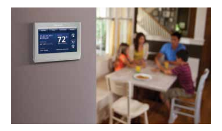
Honeywell, the leader in home comfort and indoor air quality.

Ask a professional contractor qualified to install Honeywell products about whole-house indoor air quality systems from Honeywell. You can find one at yourhome.honeywell.com when you click on Buy Honeywell Product.