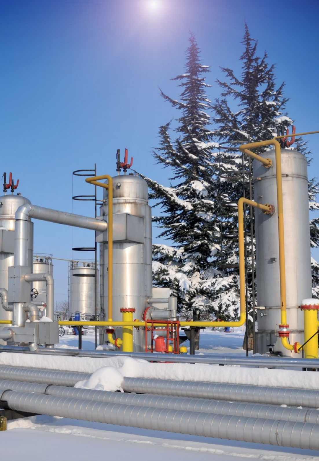
ABB ADCO ADGAS ADWEA Air Liquide Al Hosn Gas AlexFert Alfa Laval Alstom Ashcroft Bapetco BASF Baumer Bayer Borealis Borouge BP Caterpillar Chevron China Enersave CNNC Conoco Philipps CPC CTCI Corporation Daelim Danfoss DEWA DOW Chemical Emerson (Rosemount) Endress + Hauser E.ON ESNAAD Evonik ExxonMobil Fujian Ningde Nuclear Power Company GASCO