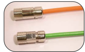
Flex cables for MP-Series Motors and other motors and actuators with DIN style connectors.

Refer to the Motion Control Selection Guide, Publication GMC-SG001x to select the cables for your motion control system.